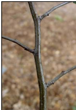
Twigs of many other trees occur singly and alternate from side to side.