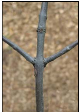
Ash twigs occur in pairs on opposite sides of a branch.