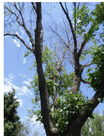
An infested ash tree.

Another tactic to slow tree mortality is the introduction of natural enemies, insects that feed on emerald ash borer. While the introduction of these insects will not eliminate the threat, nor are