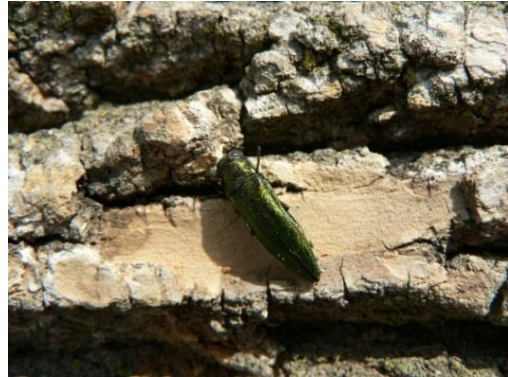
Emerald ash borer adult on the bark.

Emerald ash borer ( Agrilus planipennis ) is an Asian beetle that infests and kills ash trees. Since its accidental introduction into Michigan sometime during the mid-1990s, it has spread to 31 states and 3 Canadian provinces. North American ash species, black ash ( Fraxinus nigra ), green ash ( F. pennsylvanica ) and white ash ( F. americana ) have no natural tolerance or resistance to this insect. Once emerald ash borer is found in a community, all ash that are not protected by insecticide treatments will be killed within five to ten years.