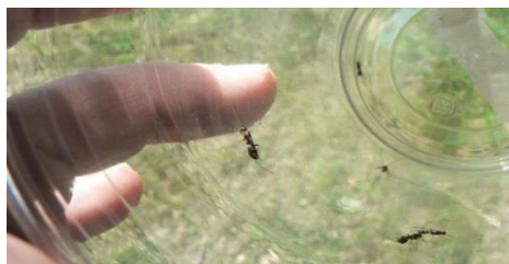
Oobius agrili adults being released.

These parasitoid wasps are also known as non-stinging wasps and pose no threat to humans, other animals, and even insects other than the emerald ash borer. These wasps are so tiny, about 1/8-inch, that they are difficult to see and will not be noticed by most people. These insects will be released on infested ash trees in the northern part of Sioux Falls during August and early September 2018.