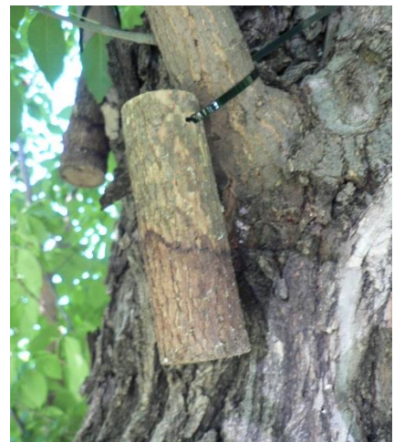
A log attached to a tree containing Tetrastichus planipennisi adults.

These insects will be released on trees infested by emerald ash borer, but are not being treated with insecticides, during early August. Some of these wasps will be released by attaching small logs containing the insects onto trees, others through cups attached to the tree. The egg wasp will be release by shaking them out of small cup. The releases will be monitored, and data collected on their effectiveness at slowing the spread of emerald ash borer.